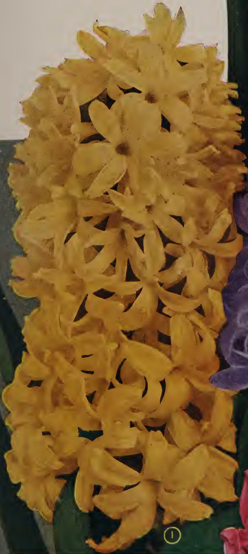
Matchless Rich Yellow